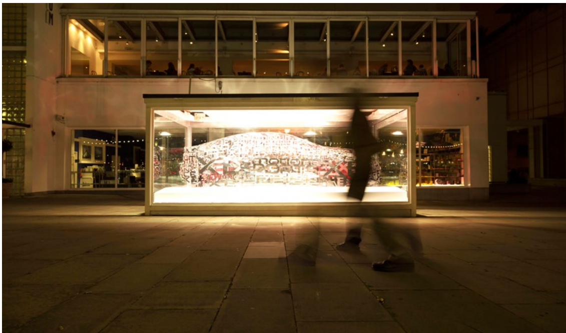
SLEEK & ARTICULATE: Outside London's Design Museum