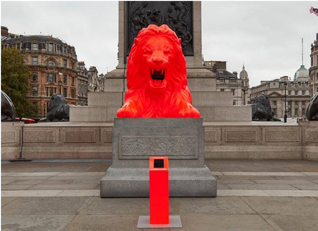
Replicating Detail: Both lion and plinth looked convincingly at home next to Landseer's famous bronze sculptures.